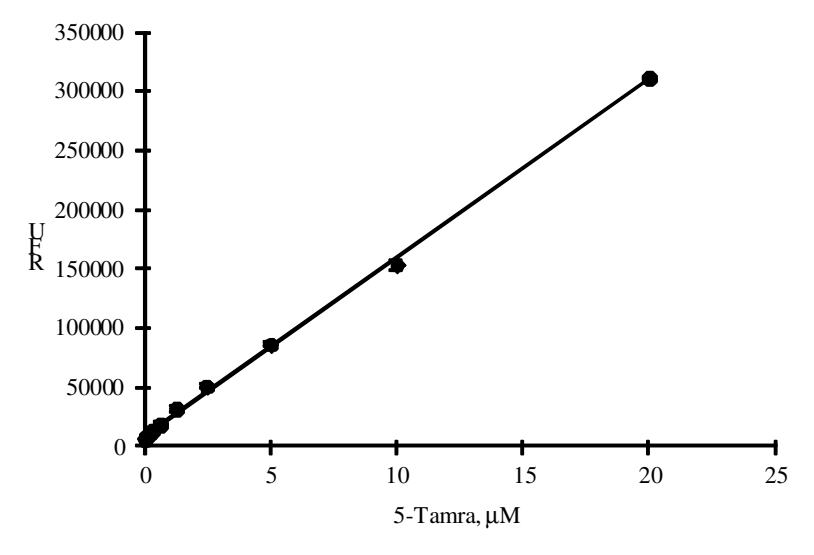
Figure 2. 5-TAMRA standard. 5-TAMRA was serially diluted in assay buffer containing substrate (FlexStation 384II, Molecular Devices; Ex/Em=540nm/575 nm, cut off 570nm)

Note: The final concentrations of 5-TAMRA reference standard solutions are 20, 10, 5, 2.5, 1.25, 0.625, 0.3125 and 0 \mu M. This reference standard is used to calibrate the variation of different instruments and different experiments. It is also an indicator of the amount of enzymatic reaction final product.